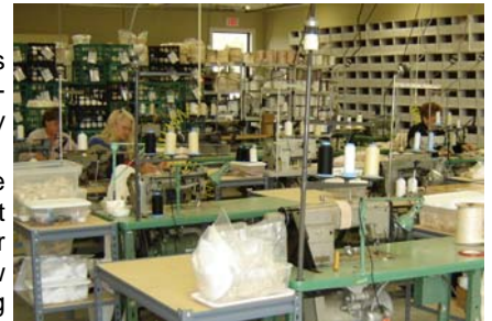
LW employees making undergarments

Custom fittings are by appointment, Monday thru Friday. Contact the company at 615-444-1004 or on their new website coming May 1, 2007 at NorvellBra.com .